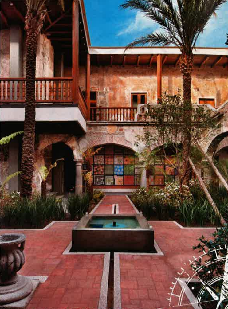
The hotel's charming courtyard, inviting exterior, decorative accents, and stunning spa are bringing new life to the historic district of Puebla, Mexico.